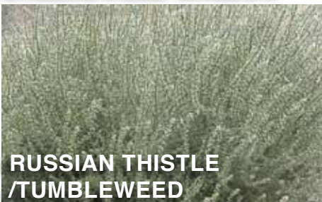
RUSSIAN THISTLE /TUMBLEWEED