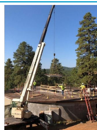
A crane lifts the eight-by-eight-foot opening that was saw-cut into the concrete roof.

Follow the project's progress through this story map . Water Services remains committed to keeping a safe and reliable water supply flowing today, tomorrow, and for decades to come.